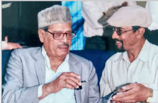
With Mr. Manna Dey, Indian Playback Singer