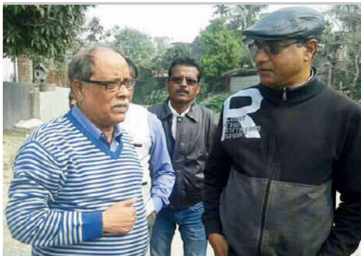
With MLA Ashok Bhattacharya, Hon'ble Mayor of Siliguri Municipal Corporation, MLA Siliguri, 2021