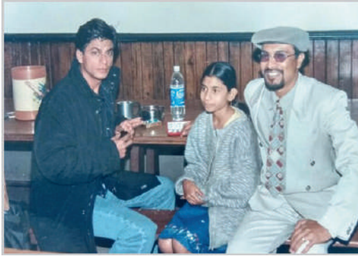
With Mr. Shah Rukh Khan, Indian film Star