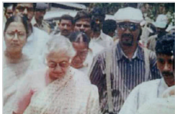
With Mrs. Sheila Dikshit Honorable Chief Minister of Delhi, 1998