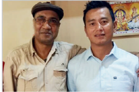
With Mr. Bhaichung Bhutia, Ex. Captain of Indian football Team