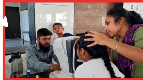
Free Health Camps