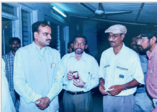
With Mr. Ananth Kumar, Union Cabinet Minister, Tourism and Culture, 2001 and Mr. Santosh Gangwar (MOS)