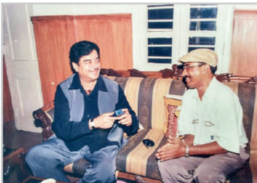
With Mr. Shatrughan Sinha, Indian Film Star and MP