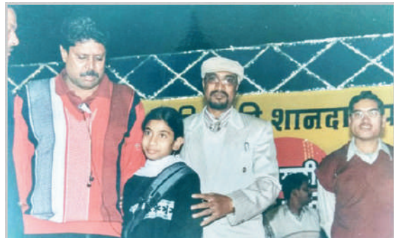
With Indian Cricketer and Ex. Capetian of the Indian National Team, Mr. Kapil Dev