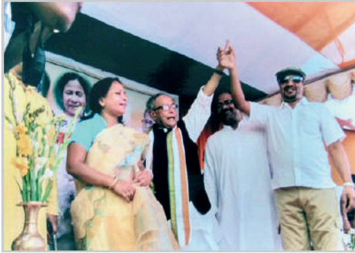
With Former President of India Dr. Pranab Mukherjee