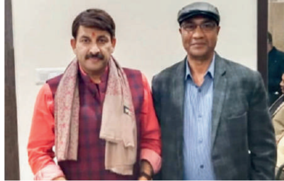
With Hono'ble MP, Bhojpuri Actor & Singer Mr. Manoj Tiwari