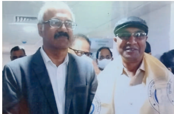
With Honorable Padmashri and Padmabhusan awarded Dr. D. Nageswar Reddy (Hyderabad), 2021