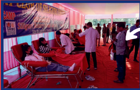
Blood Donation Drives