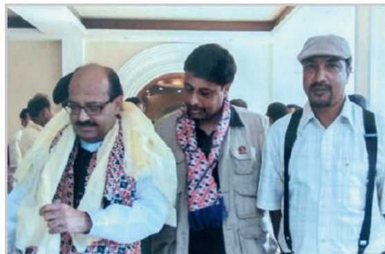
With Mr. Amar Singh, leader of Samajwadi Party (MP), UP