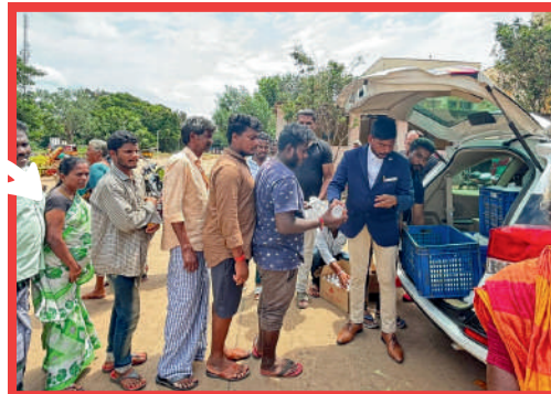
Free Food Distribution