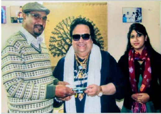
With Mr. Bappi Lahiri, Indian Music Composer, Music Director, Singer, Actor and Record Producer